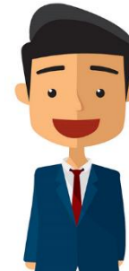
IT & Network Administrator