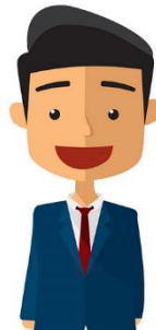
Rodent & Insect Pest Controller