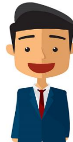
Quality Assurance Head